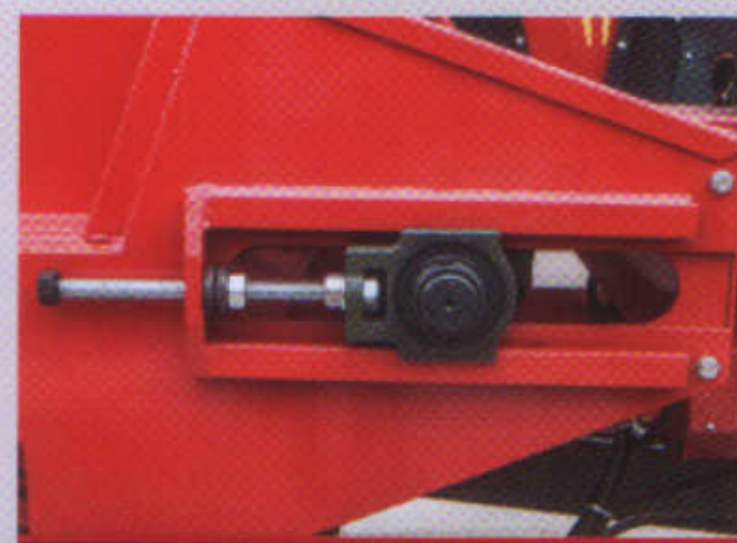
Chain tension system