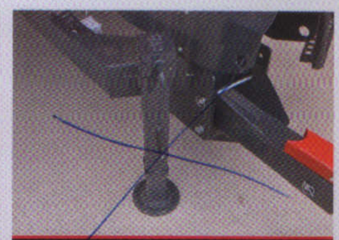
Adjustable support leg