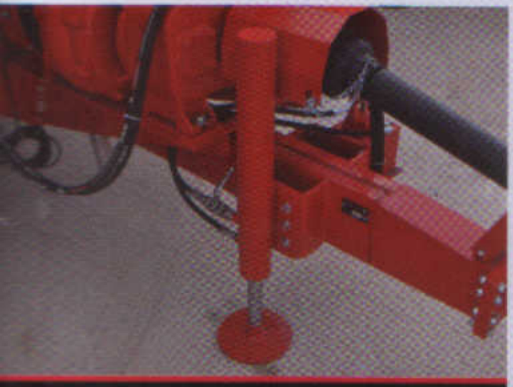
Support leg with pump