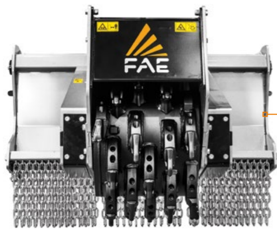
Transmission with belts