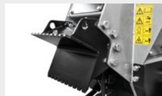
Front fixed thumb