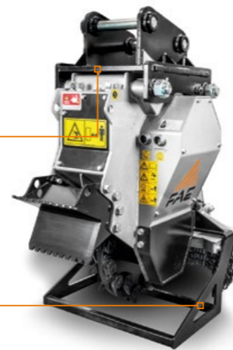
Adjustable supporting service stand for storing the machine when not in use