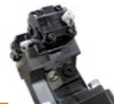
Front hydraulic hood with bolt-on chains

adjustable motor to obtain the maximum performance from any excavator, protected from dirt and damage