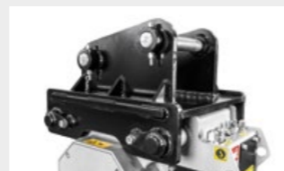
Customized attachment bracket