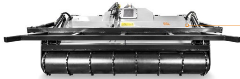
Adjustable counter-blade for longer working life