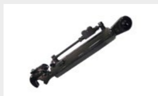
Hydraulic top link