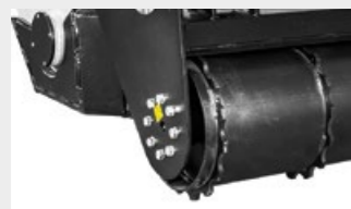
Hydraulic controlled roller helps with compaction and working uneven terrain