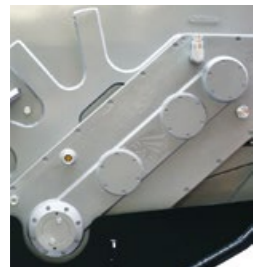
Dual transmission with side gearbox increase power delivery to the rotor