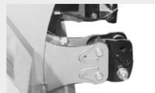
Extended 3 point linkage